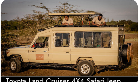
Toyota Land Cruiser 4X4 Safari Jeep