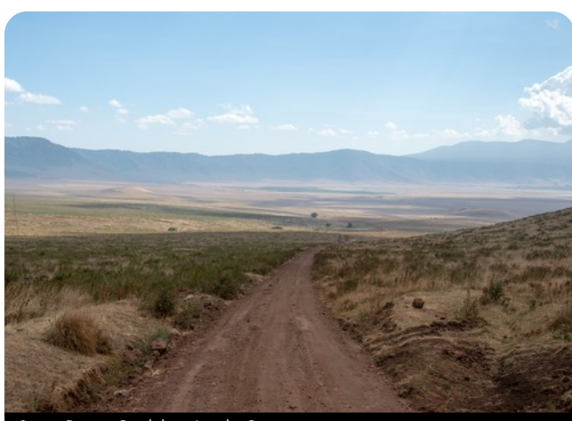
Seneto Descent Road down into the Crater